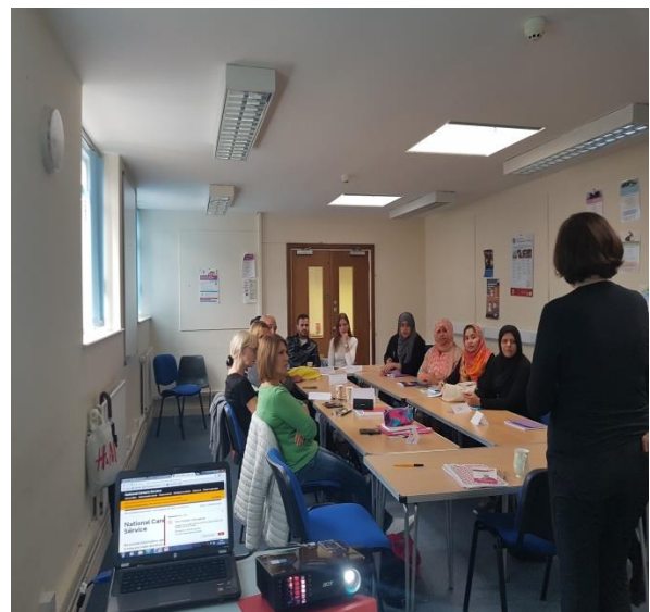
ESOL Class - mix of participants from various backgrounds and gender