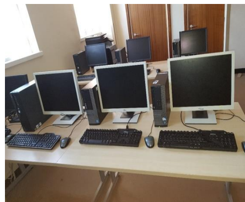
Some of the IT Café equipment