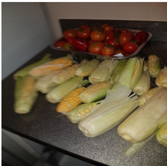
Sweetcorn and tomatoes harvest – Sept 2018

The Gardening for Health project where ACCM (UK) continues to work on and work two Council allotments continues to grow from strength to strength. Some users found it hard work and dropped out while four continued in the second year of 2018 to 2019. The weather was very good and more harvest was achieved than planned especially spinach, herbs, carrots, pumpkins, zucchini, tomatoes, onions and sweet corn. The crops were shared between staff and users.