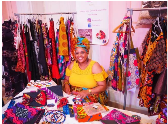
African Lady selling African colourful costumes and fabric

The organisers from various countries including Uganda, Kenya, Zimbabwe, Ruanda and Nigeria have now firmly put BAC Event as a popular annual event on the Bedford annual Calendar. The event held 23 rd June 2018 attracted over 700 from all walks and was led by the Mayor of Bedford, David Hodgson MBE, Bedfordshire High Sherriff, Dignitaries from Zambian and Kenyan High Commissions, various local Councillors and local MP for Kempston and Bedford all attending. The day was colourful with a variety of activities including drummers, singers, magic, traditional plays, children activities, and fashion parade from different countries. The