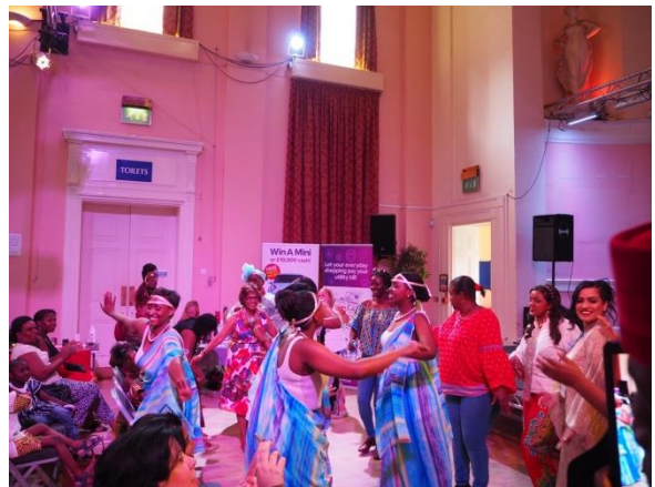
Ruandan Dancers showing off their colourful style and dance