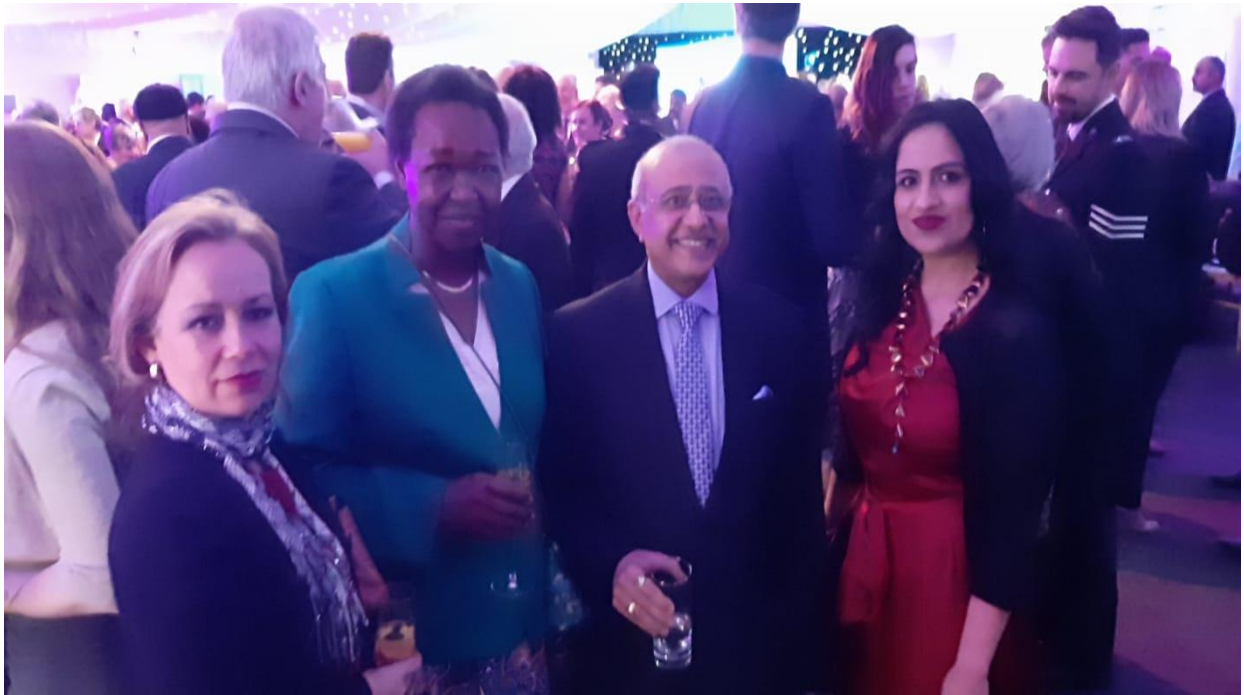
ACCM (UK) staff with former High Sheriff for April 2017 to March 2018