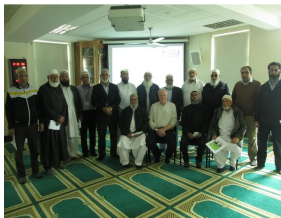
Prostate Cancer workshop participants