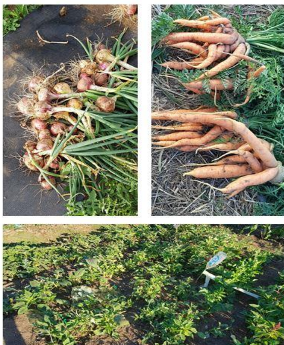
Allotment harvest – September 2018