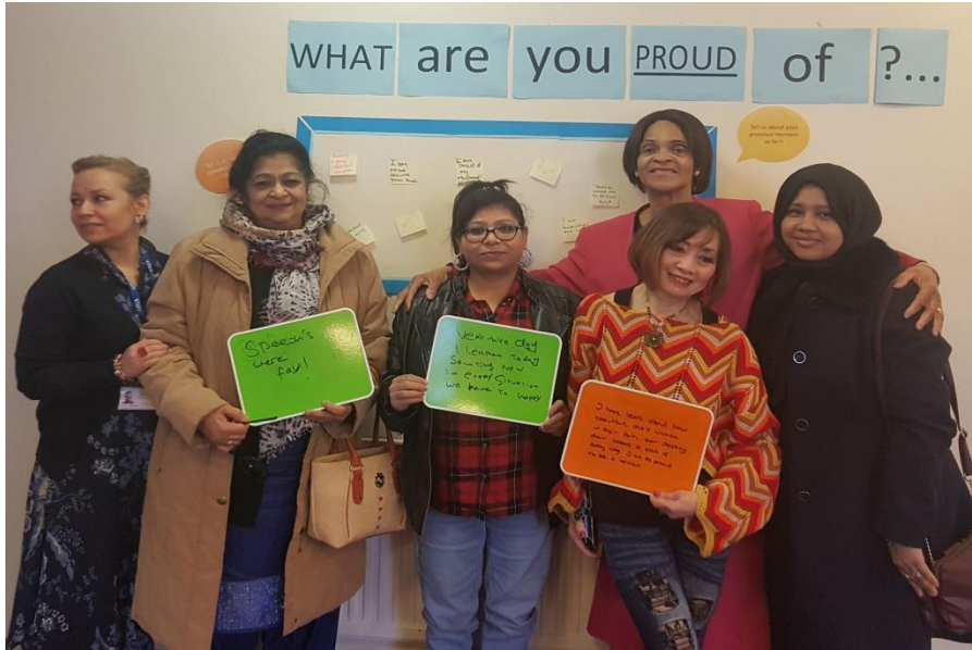
This photo says it all on how women feel about the special Women's Day Celebrations