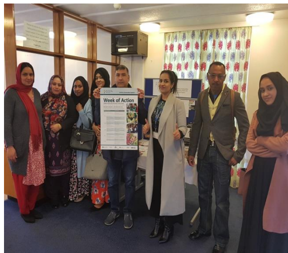
Some of the participants at ACCM (UK)'s Action Week events