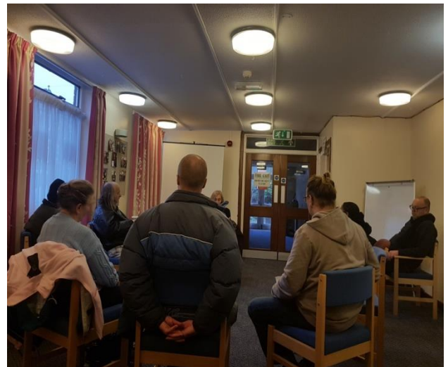
I am Who I Want to Be - Mindfulness session

employment, majority now say they are happier with their situation.