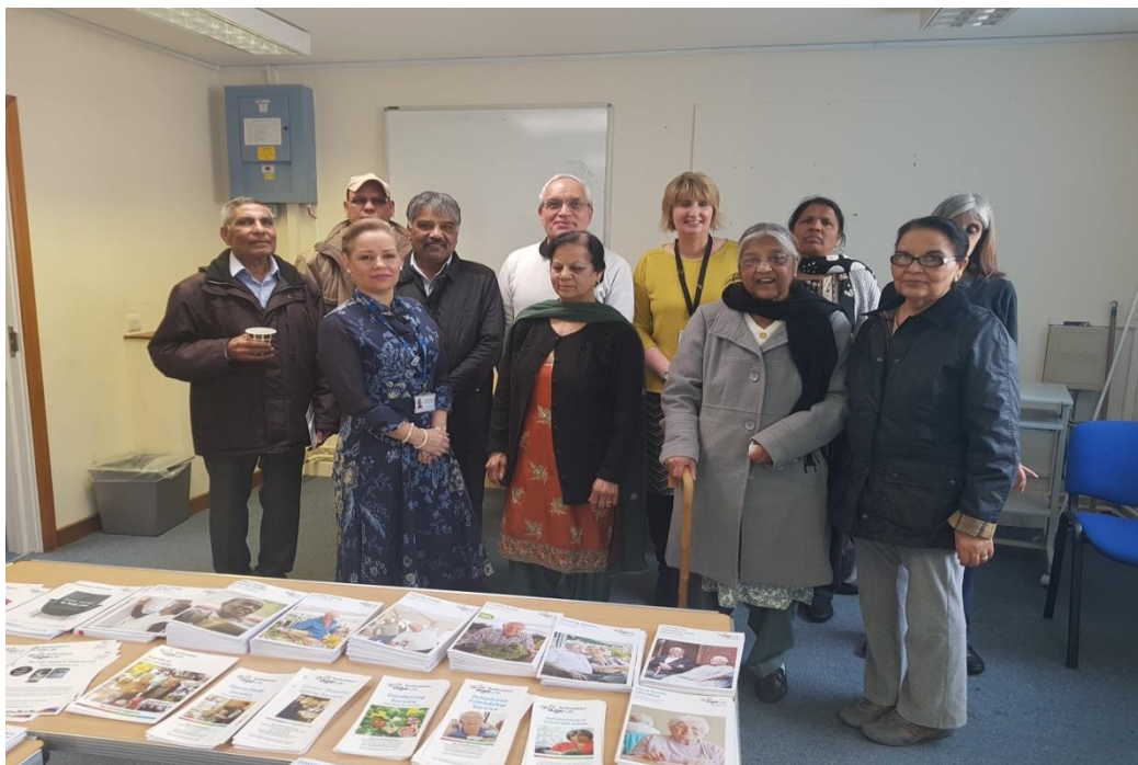
Some of our elderly citizen members with Age UK Representative in Yellow top behind

ACCM (UK) through its drop in coffee morning sessions we have a groups of elderly citizens who attend some of the activities we put on for them. Sometimes they just sit with others enjoy a coffee, play board games or do puzzles or share old times stories that are often very interesting, Age UK who is our partner has been providing some support for our group including talks, home help if required and information on various topics of interest.