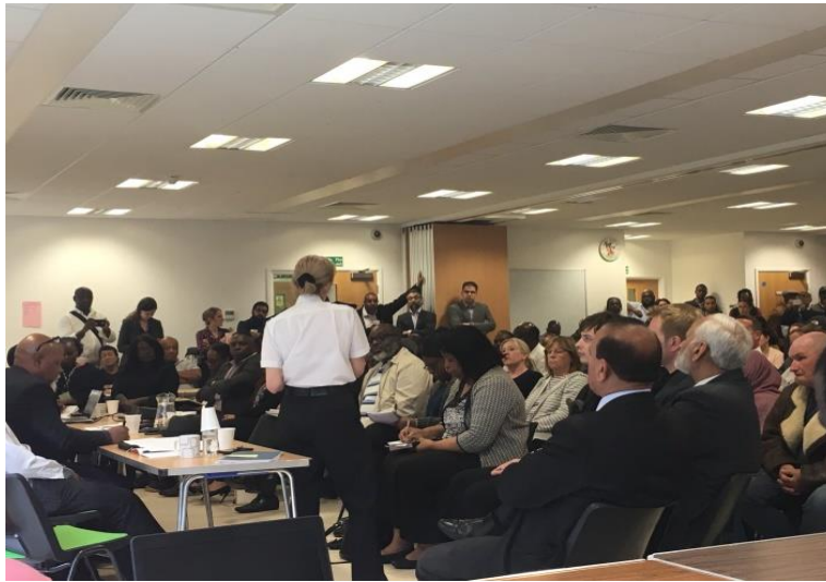
Participants attending knife crime events at ACCM (UK) – Sept 2018

ACCM (UK) continued to work in partnership with the Bedfordshire Police in delivering more events including knife and hate crime that also touched on safety and health issues as victims often find themselves traumatised. In the Year 2018 to 2019 ACCM (UK) supported 5 victims of hate and knife crime which we had not done before.