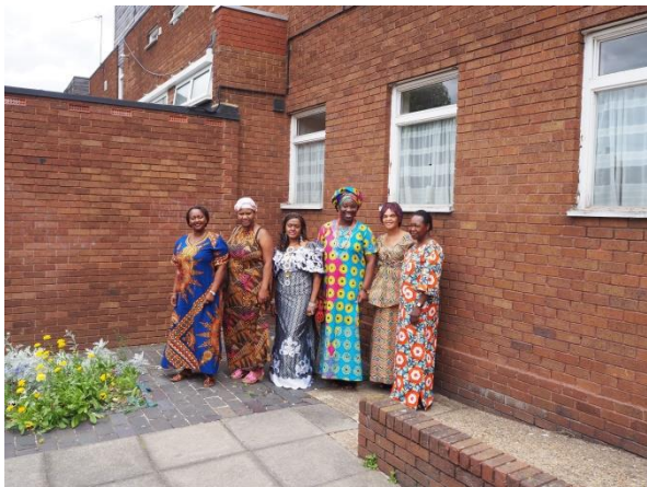
Team behind planning and organising of the BAC Event – From left Ruanda, Zimbabwe, Kenya, Nigeria, Zimbabwe and Uganda

Bedford African Community Event was ACCM (UK)'s idea of bringing Bedford African communities to get to know each other, share and support each other continues to grow in its popularity and more colourful each year. Most importantly it was to share 'What is African?' with diverse Bedfordshire communities as there is always a lot of misconceptions about Africa, its people and culture, often portrayed in Western Media as corrupt, hungry, sick or ill, civil wars leading to refugees or immigrants. This negative view of Africa has had negative impact on young Africans growing up in the UK with little connection to their country of origin losing their heritage as they do not want to associate themselves with their country of origin.